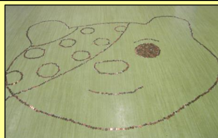
Our huge Pudsey portrait made with pennies